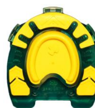
ew+ with pad