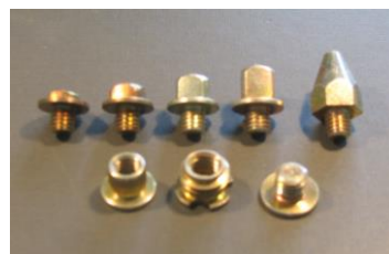
Studs with thread inserts