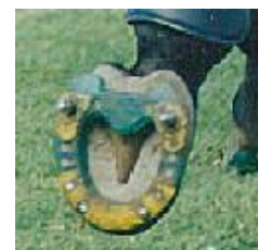
ew in show jumping